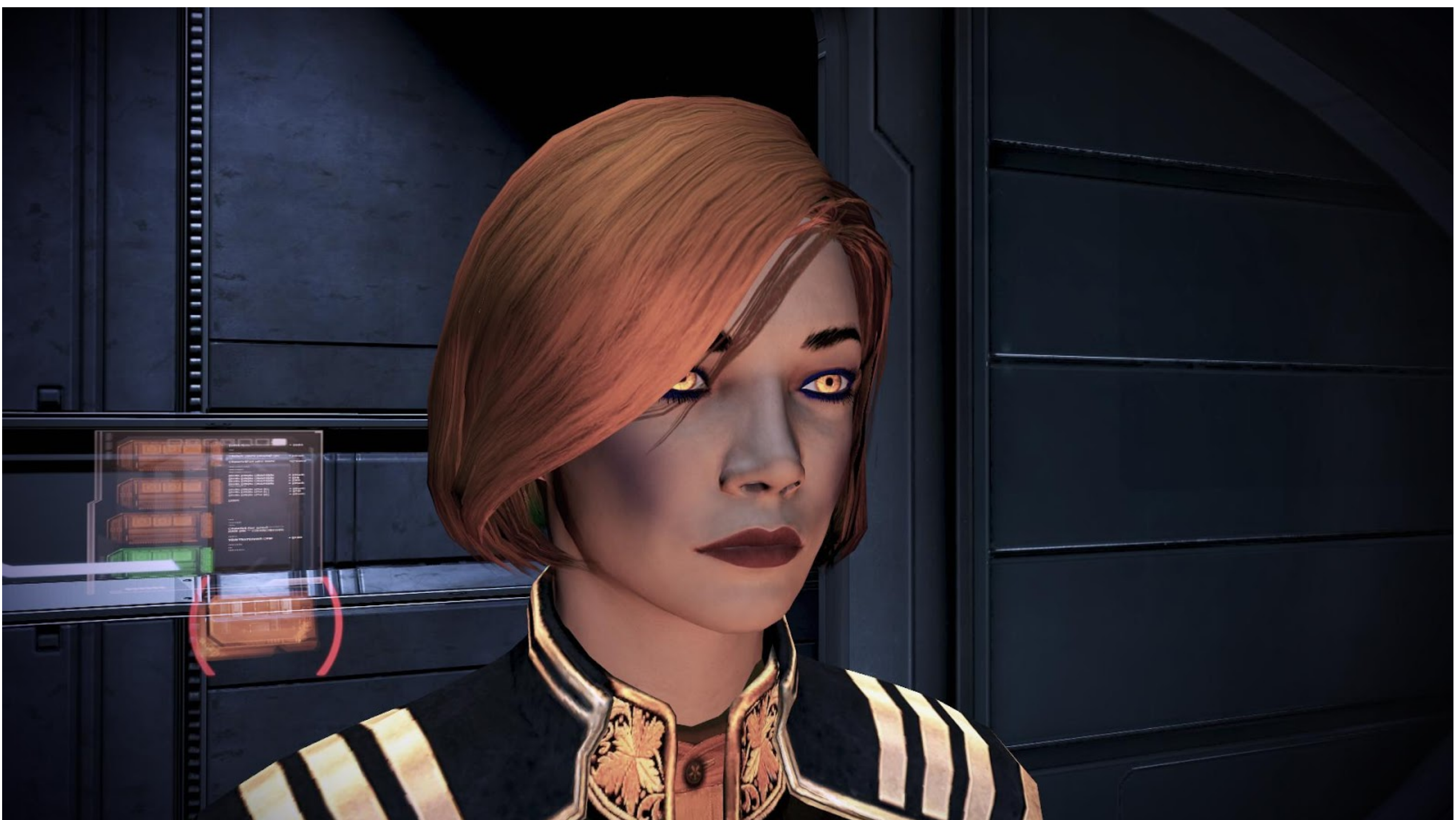
Mass Effect 2 Hair Color Vectors